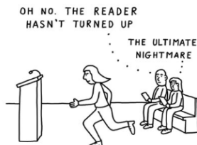
ROUND THREE: EMERGENCY LESSON-READING