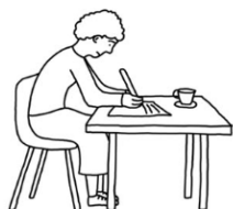
ROUND TWO: FACULTY-REGULATIONS EXAM