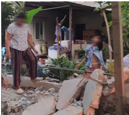
Devastation in Myanmar

Please pray for them to receive resilience and strength from God, and to know His kindness and presence.